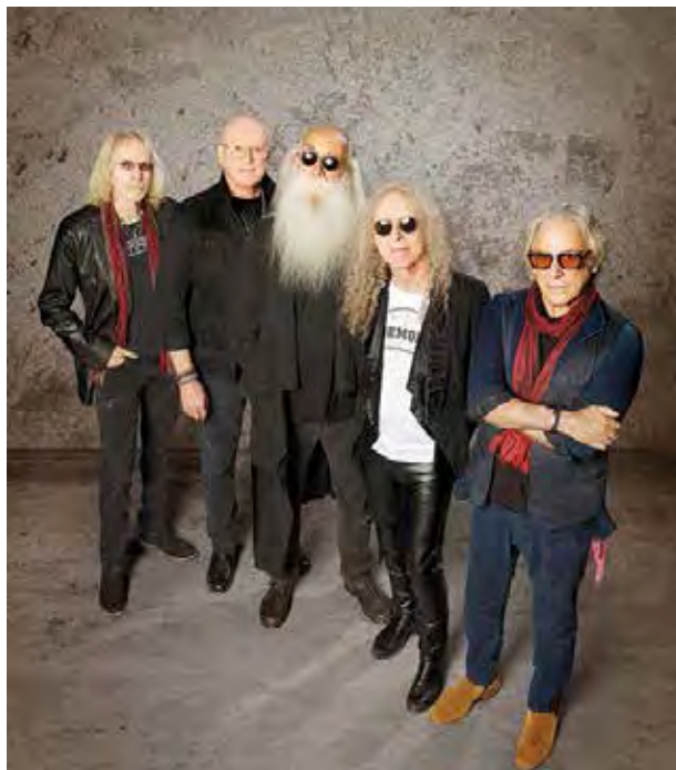
Left to Right: Steve Postell, Russ Kunkel, Leland Sklar, Waddy Wachtel and Danny Kortchmar