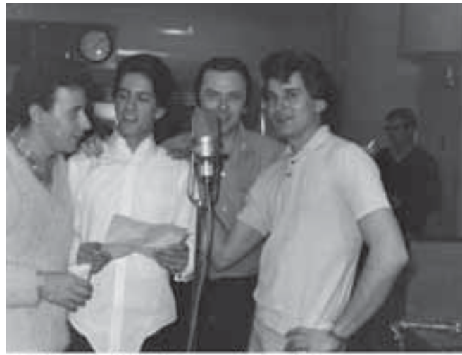
Outsiders at Cleveland recording studio

Don continues, "It's really difficult to get air play on a radio station. It's all very mechanical and corporate. You can't even get your foot in the door. Most stations are not