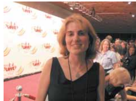
On the red carpet for The Beatles, LOVE premiere, Las Vegas.