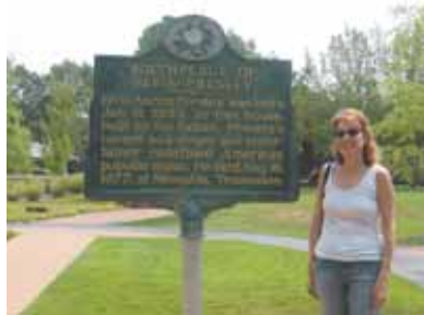
At Elvis' birthplace, Tupelo, Mississippi