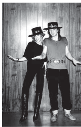
Striking a pose with Stevie Ray Vaughan