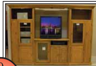
Aspen Light-Oak Four-Piece Entertainment Wall System.....$1,999