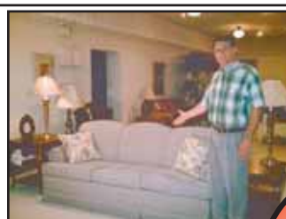
Smith Brothers of Berne sofa, blue mini-plaid $999.00

Make Your Home Feel Like A Vacation Get-Away Every Day of the Year!