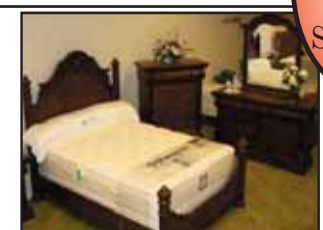
Broyhill queen size four piece dark oak ornate bedroom set.....$2,199

Master Design 54" Table and Four Chairs $799