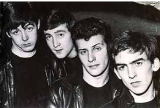
Early Beatles: (l to r) Paul, John, Pete & George

Pete Best was one of the original members of The Beatles. He was their drummer before Ringo Starr. During our telephone conversation Pete is at The Casbah Club in Liverpool, England. Original art work that was done by John Lennon and Paul McCartney still adorn the walls of The Casbah. It has stayed pretty much the same as it was since