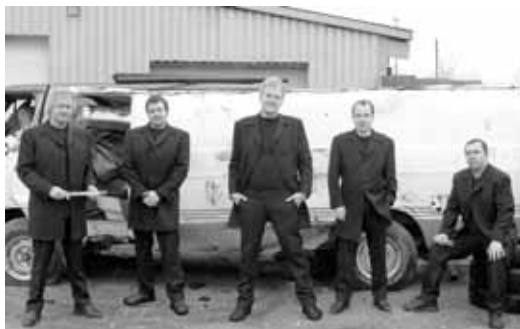
Pete Best Band

"Frans" is an endearing term that combines the words 'friends' and 'fans'