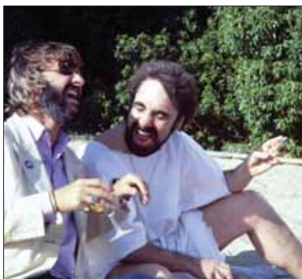
Ringo with Keith Moon

Another set of photographs that illustrate close friendships are that of Ringo with