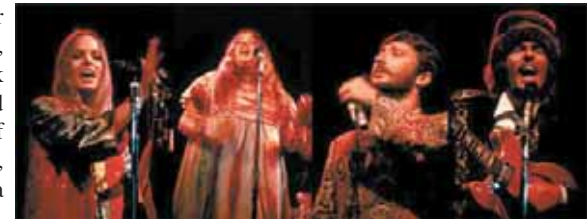
The Mamas & The Papas

Adler as their manager, producer and best friend of John Phillips, it seems fitting that the first rock festival of its kind was held in California. The summer of 1967 was for peace, love, hope, change, music and California Dreamin'.