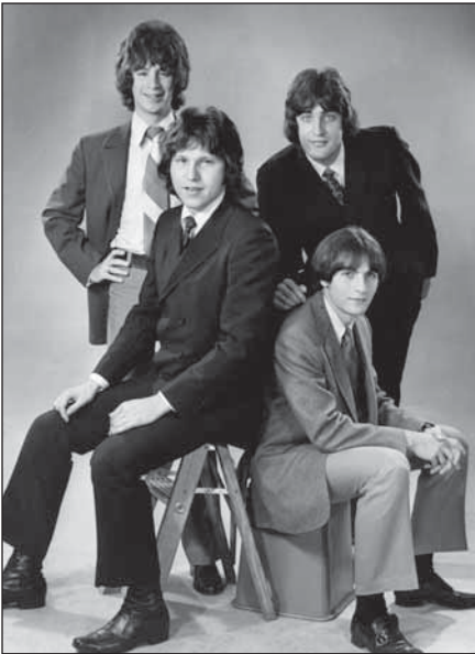
The Raspberries, page 54 From the book, “Cleveland Rock & Roll Memories;” Photo courtesy of the Cleveland Press Collection, CSU Archives

Wolff, one sees clearly that Cleveland has a rich background of rock culture that has launched many well known acts such as: The Outsiders, The O’Jays, Devo, The Pretenders, Michael Stanley Band, James Gang, The Raspberries and Nine Inch Nails. This only scratches the surface, mind you, of the artists and performers that hail from the Cleveland area.