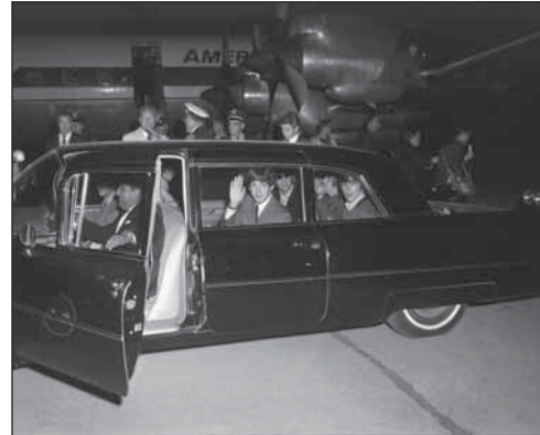
The Beatles, page 26 From the book, “Cleveland Rock & Roll Memories;”